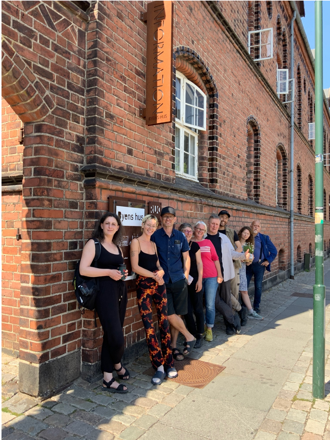
The first ARTWP live meeting held 13/14 th June 202 in Byens Hus (The City House) in Roskilde, Denmark with members of the ARTWP team members, the steering group, and the three Danish artists.